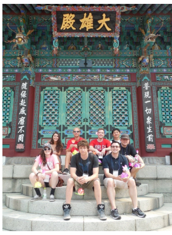
Visiting a local temple in Chun-cheon.

not to mention learning Korean language. They had the opportunity to experience Korean culture firsthand through multifarious activities including making kimchi, fermented spicy napa cabbage, and playing the jang-go, a traditional musical instrument. They learned how to become K-Pop dancers as well. Most of all, they made numerous field trips to various areas