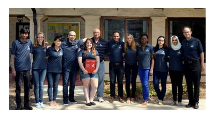
2015-16 PAIS and Summer Program Assistants.

been heavily involved in receiving, placing, and orienting the new students to school. Special thanks goes out to them for their efforts.