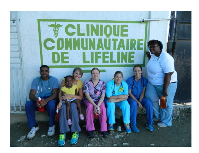
Washburn students and program leaders.

Students assisted in treating the children in the orphanage, set up a free clinic to treat local villagers, and traveled to nearby Port-au-Prince to set up a temporary clinic in a local church.