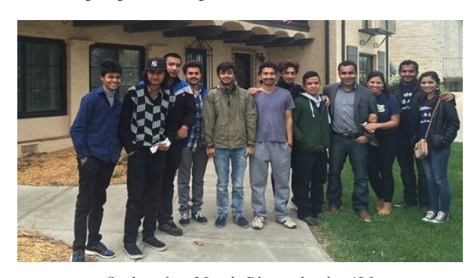
Students from Nepal.

Special tribute to Nepal: On April 25th (a day after the photo below) an earthquake of 8.0 magnitude hit Nepal and killed more than 9,000 people and injured more than 23,000. It continues to be hit daily with strong aftershocks. Washburn University will continue to stand by the people of Nepal and support our students through this difficult time in rebuilding its nation. Our thoughts and prayers are with the people of Nepal.