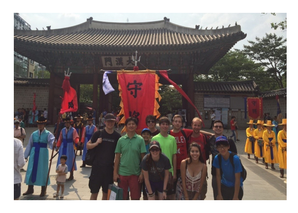
Changing of the Royal Guard at Deok-su Palace in Seoul.

There was a little bit of extra excitement and nervousness in the air because this time I was taking students to my homeland. This was the very first summer study abroad program to South Korea and I had 12 participants including non-Ichabods. From the inception, I was confident that this would be a great learning experience for students since I developed an excellent program supported by the host school, Hallym University in Chun-cheon, Korea. What made this program even better was that students were able to receive two scholarships from Washburn and Hallym, respectively.