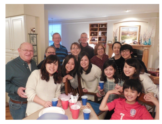
My neighbors and five Fukuoka nursing students.

I strongly recommend you host international students when you have a chance! It will be an inspiring experience, especially if you have young kids like me!!!